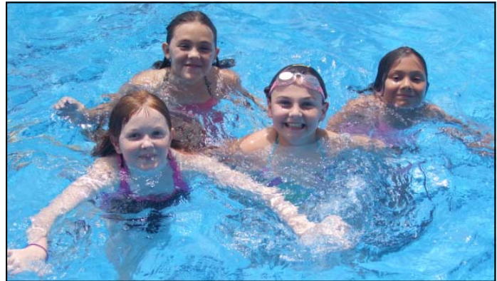
Primary Swimming Carnival