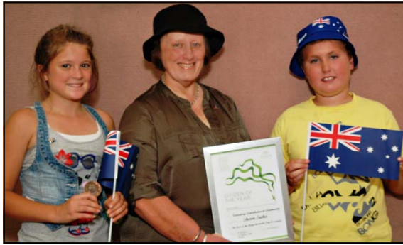
Australia Day Award Recipients