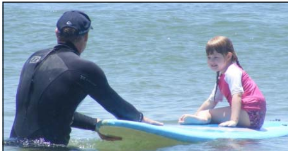
Silver Reward Day, Evans Head 2011